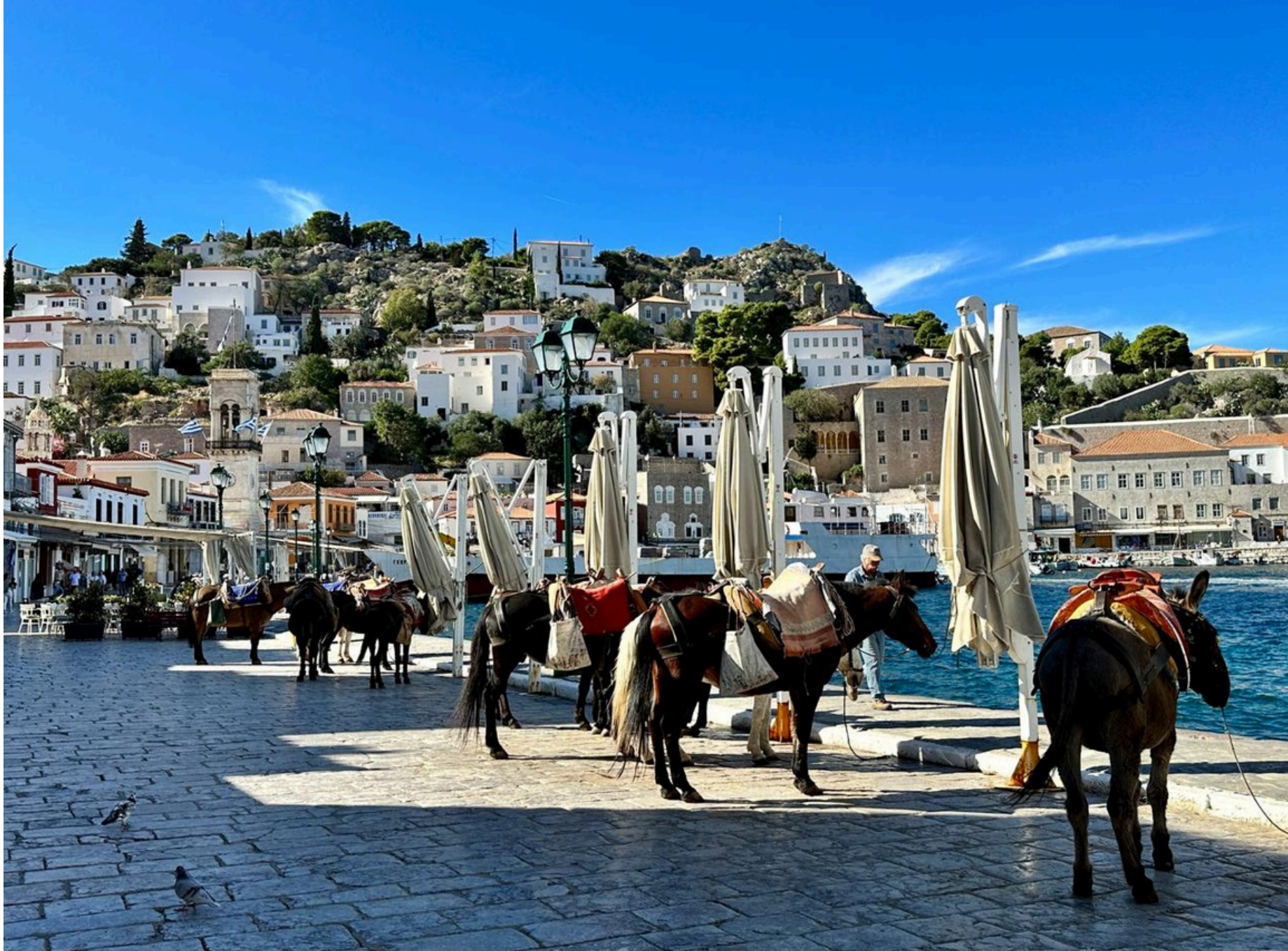
The port of Hydra