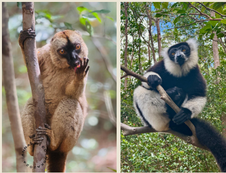
(my photos are from the park, Dec. 24)

Indulge in the luxury of having 3 nights here as you awaken each morning in a living painting. The private terrace of your bungalow a call to contemplation and well-being, offering you a unique sense of serenity and seclusion. Today your 2-hr guided walk will introduce you to the flora and fauna, enjoy a leisurely lunch, take a swim, and perhaps a boat ride this evening for bird watching? B/L/D